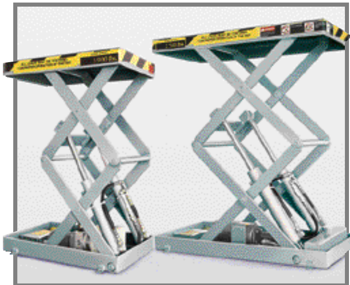
CLMYT-05-30 and CLMYT-10-30

*Standard platforms only. ***Six (6)" is a nominal dimension, may vary -0" + 1/4"